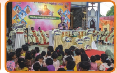
Lenten Retreat Mass, Thangachimadam