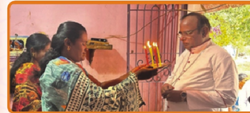
Pastoral Visit, Vallani