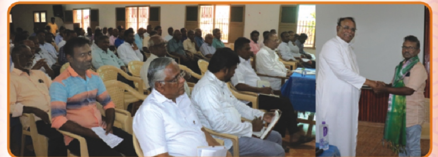
Clergy Recollection, VPC