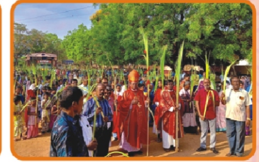
Palm Sunday, Sivagangai