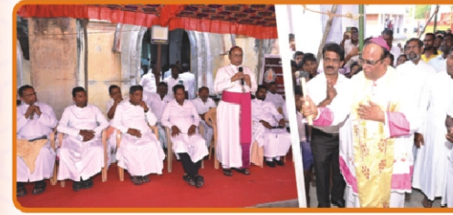
Inauguration of Renovation of St. James's Church, Mookaiyur