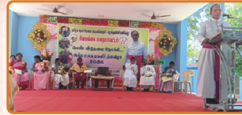
Women's Day Celebration (SC, ST Commission), Ramnagar

We offer our hearty congratulations and prayerful wishes to the Sacerdotal Silver Jubilarians. May the Lord bless them with good health and long life. Ad Multos Annos!