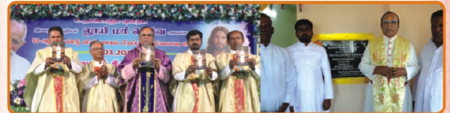
Servant of God Leveil's Day, Sarugani